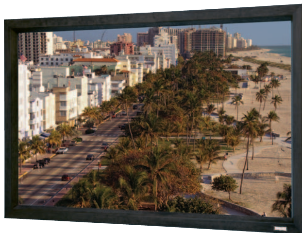
Da-Mat, High Contrast Da-Mat, Da-Tex (Rear), Pearlescent, Cinema Vision, High Contrast Cinema Vision and Dual Vision fabrics will be seamless up to 16' high. High Power® fabric will be seamless up to 6' high. Audio Vision, High Contrast Audio Vision and High Contrast Cinema Perf will be seamless up to 8' high.