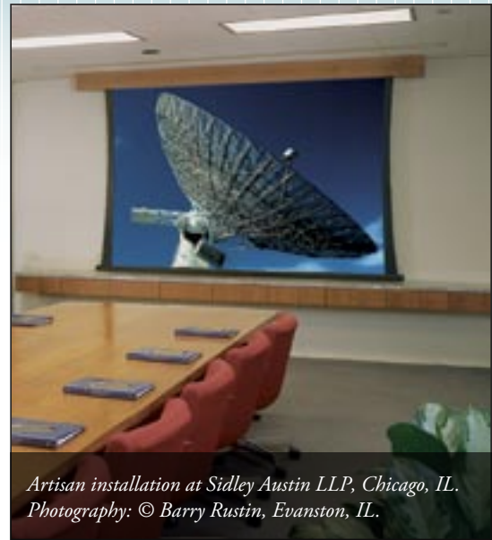
Artisan installation at Sidley Austin LLP, Chicago, IL.