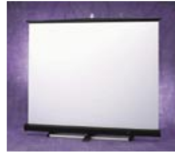
Luma 2/R with Floor Stand