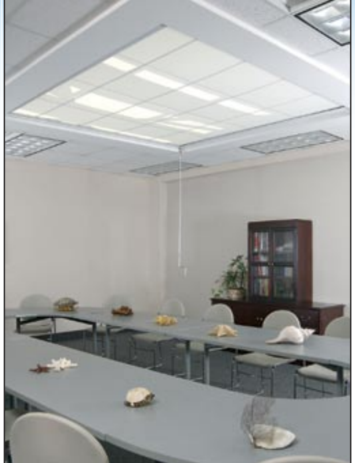
Skylight FlexShade with "E" Screen 5% at Lawrence North High School. Installation: SPD Textile & Drapery, Inc. All of Indianapolis, IN. Shown closed above, partially open below.

Note: To facilitate proper operation, Skylight FlexShades must be installed square and with rollers level. Installers must be qualified craftsmen.