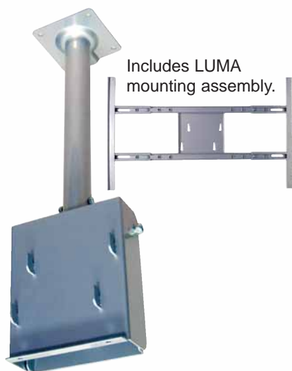
LUD3 • 31½"W x 1¼"D x 21"H • 6 Lbs.