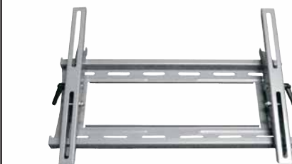
LUD2 • 8¼"W x 1¼"D x 14½"H • 5 Lbs.