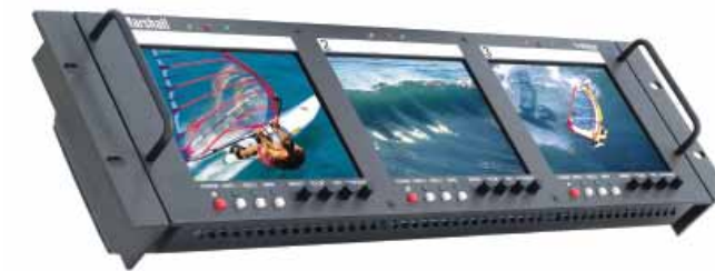
V-R563P-SDI Users Guide

1910 East Maple Ave. El Segundo, CA 90245 Tel.: 800-800-6608 • Fax: 310-333-0688 www.LCDRacks.com Email: sales@lcdracks.com