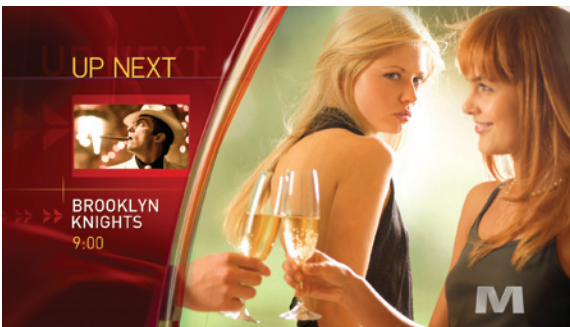
Intuition XG is ideal for highly animated 'Coming up next' graphics