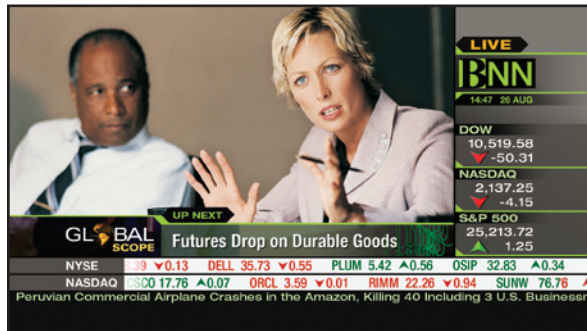
Complex, data-driven graphics with multiple layers of animated and dynamic text