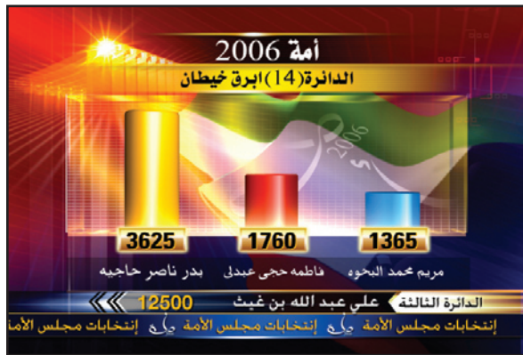
Advanced multi-level HD/SD character generation with full TrueType / Unicode character support