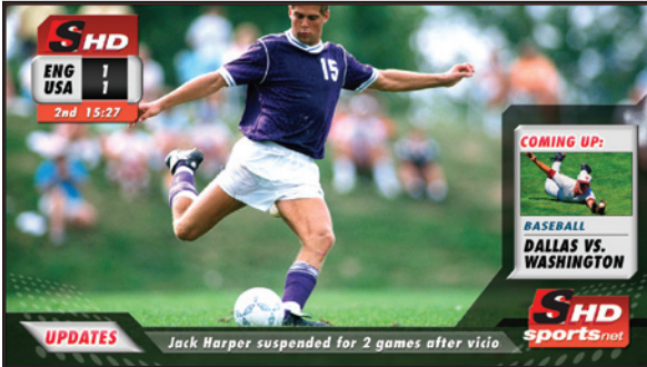
Playout of one or more clips allows creation of advanced promotional graphics effects

Intuition XG provides all the playout capabilities for the most advanced branding and promotional graphics