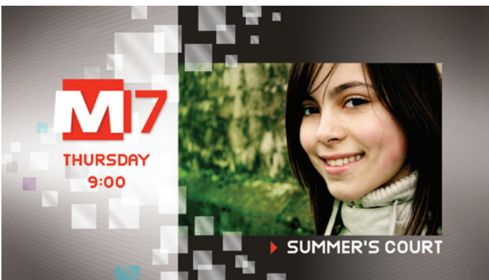
Highly engaging interstitial promos can be playout by Intuition XG