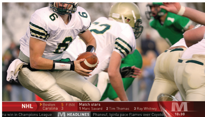
Intuition XG provides a virtually unlimited number of layers of character generation