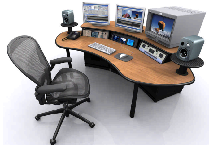
(shown with optional speaker modules)