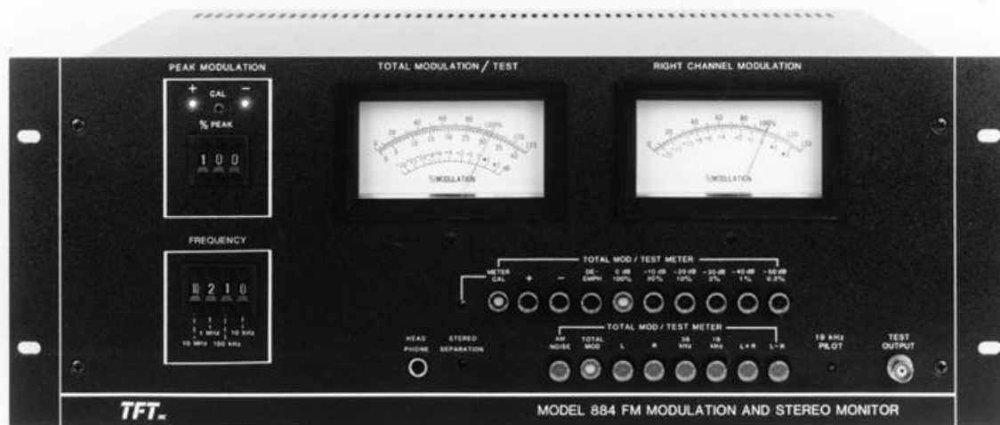
FM Stereo Modulation Monitor/Analyzer