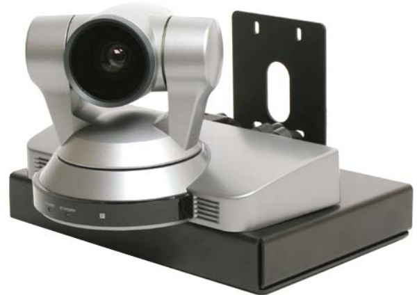
Figure 1: (top) Quick-Connect CCU 1 RU rack mount interface; (bottom) WallVIEW Universal PRO HD1 System with Camera, EZIM and Wall Mount

Overall, the WallVIEW CCU HD1 is superb for a wide range of high definition shooting applications. It is also highly suitable for applications where adjusting the color and brightness levels of one or multiple cameras is critical, such as houses of worship, corporate boardrooms, live event production and distance-learning applications.